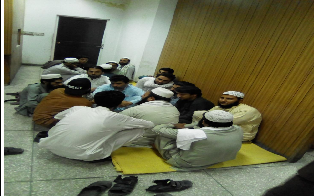
Affectees are waiting to collect their cheques from Director Finance

APs of Firdous underpass are signing their papers for preparation of cheques