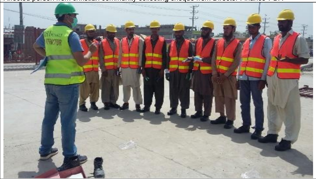
Safety tools are practiced on construction sites