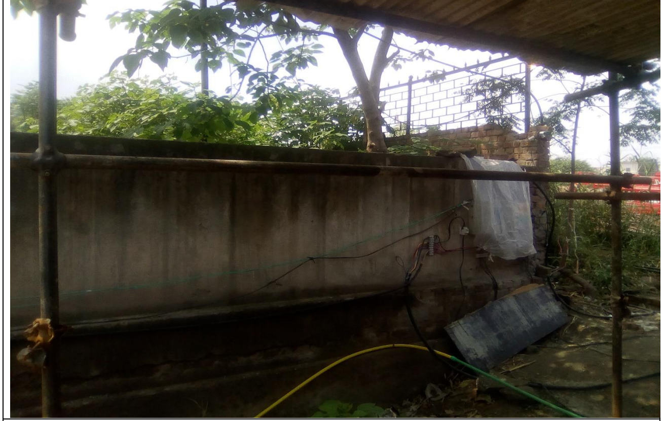
Outer wall/Boundry wall of the building at Dabgary Garden that will be temporarily removed