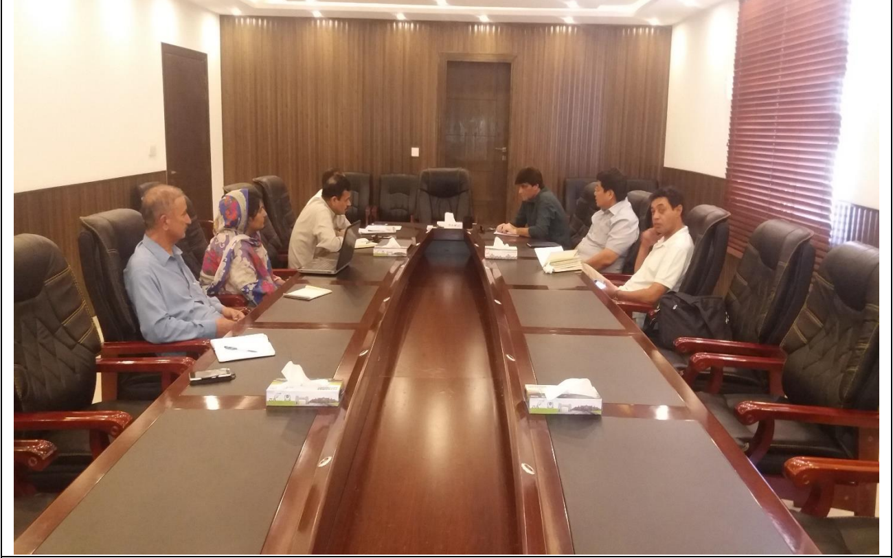
Meeting with ADB Represetatives at DG-PDA meeting Hall