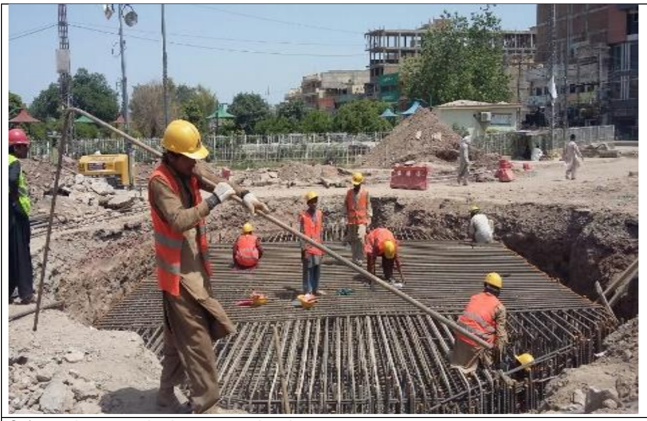
Safety tools are practiced on construction sites