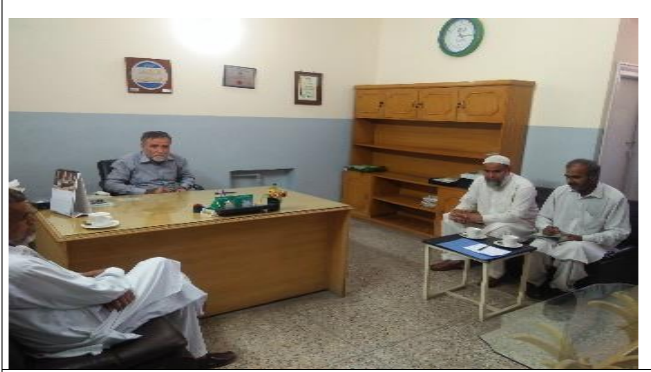
Sensitization session in Hospital