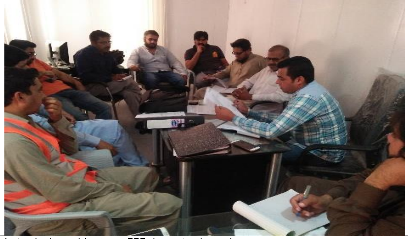
Instruction been giving to use PPEs in construction works