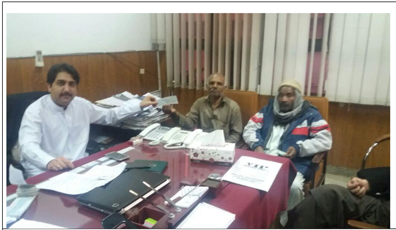
Affected person from christian community collecting cheque from Director Finance-PDA