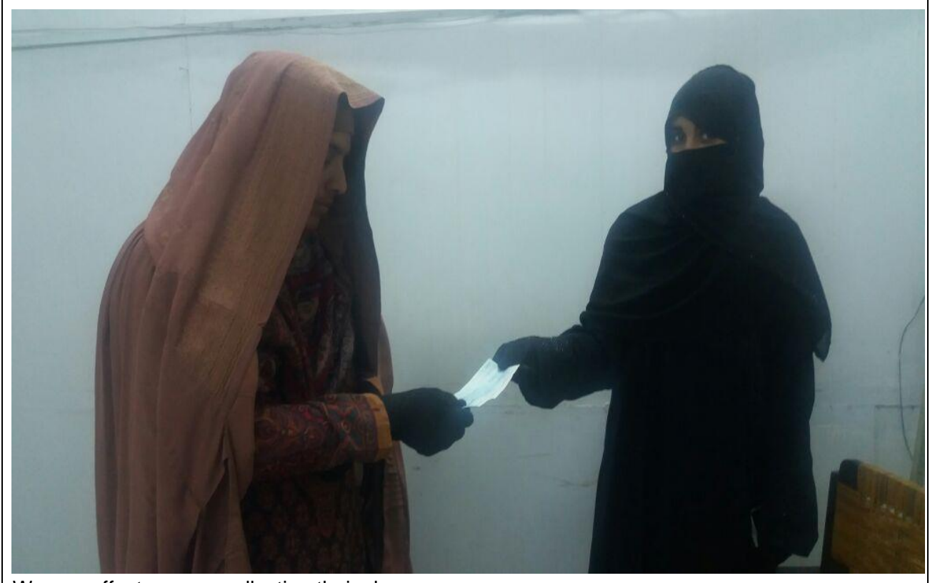
Women affectees are collecting their cheques