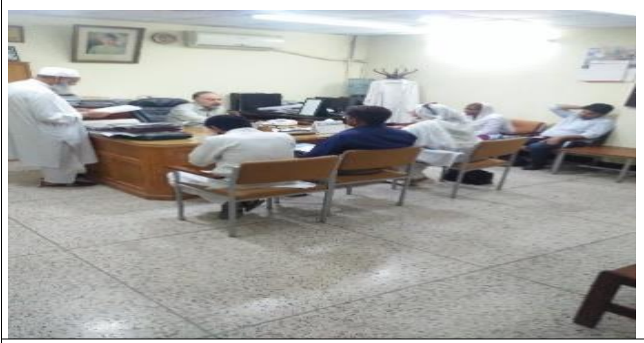
Sensitization session in Lady reading Hospital