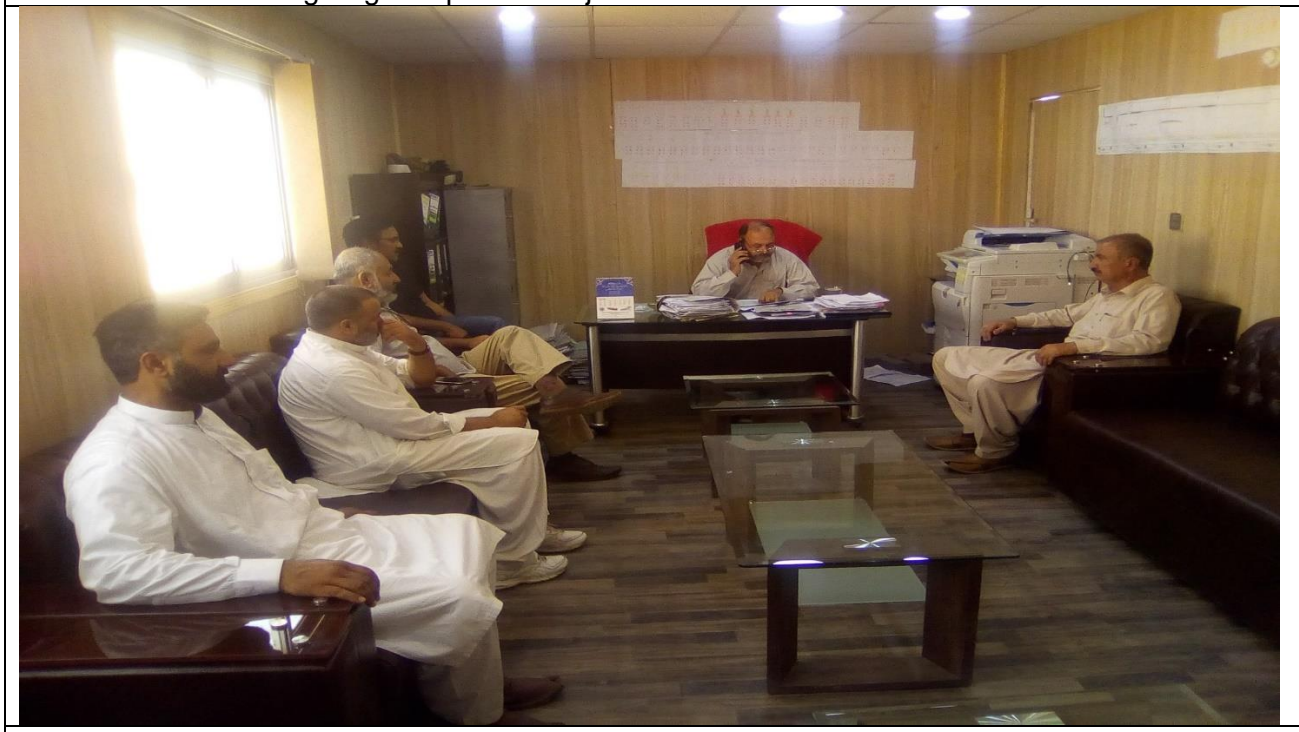
Consultation meeting in Office of DD-PDA at Reach-1, Contractors' Camp Office

Director finance-PDA giving cheques to Project affectees